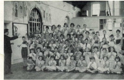
SCHOOL ORCHESTRA, 1959

We're really looking forward to next term also, when we have more great learning experiences planned. Despite all that is going on in the world at present, we are determined to give your children the best possible educational experience. Please do always let us know if there is anything we can do to support. We hope that you all have a restful, peaceful and happy break, and we will see you all in the new year.